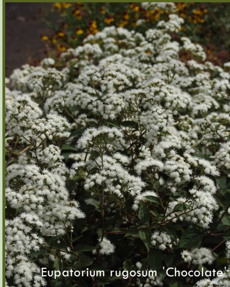
Eupatorium rugosum 'Chocolate'