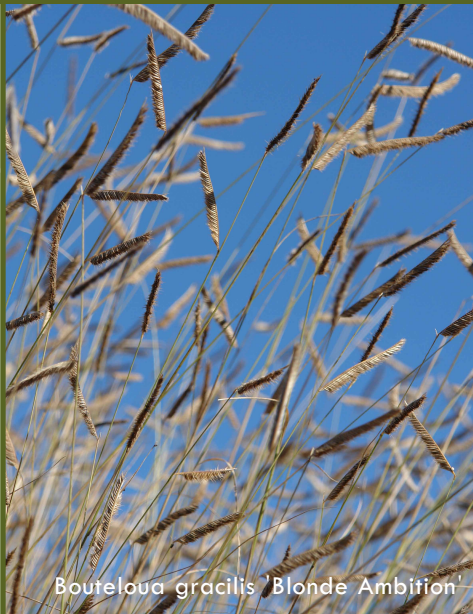
Bouteloua gracilis 'Blonde Ambition'

Achillea cvs. Agastache sp. and cvs. Allium cernuum Andropogon virginicus Asclepias verticillata Asclepias syriaca Asclepias tuberosa Aster ericoides 'Snow Flurry' Aster oblongifolius cvs. Baptisia sp. and cvs. Bouteloua gracilis 'Blond Ambition' Calamintha cvs. Callirhoe involucrata Calylophus serrulatus 'Prairie Lode' Caryopteris cvs. Chrysopsis mariana Delosperma sp. and cvs. Dianthus cvs. Dracocephalum ruyschianum 'Blue Dragon' Echinacea sp. and cvs. Eragrostis spectabilis Eryngium 'Big Blue' Eupatorium hyssopifolium Festuca glauca 'Elijah Blue' Gaillardia cvs. Gaura cvs. Liatris microcephala Lupinus perennis Myrica pennsylvanica Nassella tenuissima Nepeta cvs. Oenothera sp. and cvs. Panicum sp. and cvs. Pennisetum sp. and cvs. Perovskia cvs. Pycnanthemum flexuosum Pycnanthemum muticum Ratibida pinnata Rudbeckia sp. and cvs. Ruellia humilis Salvia cvs. Schizachyrium sp. and cvs. Sedum sp. and cvs. Sisyrinchium angustifolium 'Lucerne' Solidago sp. and cvs. Sorghastrum nutans Sporobolus heterolepis Stachys cvs. Thermopsis sp. and cvs.