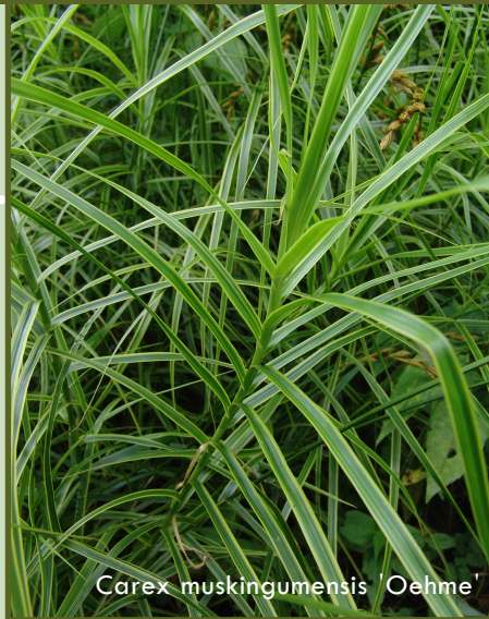
Carex muskingumensis 'Oehme'

Athyrium sp. and cvs. Carex comosa Carex emoryi Carex lurida Carex muskingumensis 'Oehme' Carex radiata Carex stricta Carex vulpinoidea Chelone glabra Chelone lyonii 'Hot Lips' Dryopteris × australis Dryopteris erythrosora 'Brilliance' Dryopteris goldiana Dryopteris marginalis Dryopteris pseudo-filix-mas Lobelia cardinalis and cv. Lobelia siphilitica Matteuccia struthiopteris Onoclea sensibilis Osmunda cinnamomea Osmunda regalis var. spectabilis Senecio aureus Spiranthes cernua var. odorata 'Chadds Ford' Thelypteris decursive-pinnata Thelypteris noveboracensis Woodwardia virginica