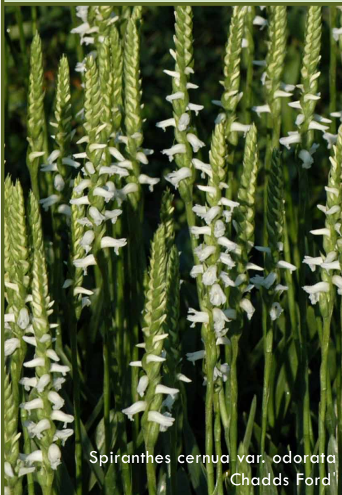
Spiranthes cernua var. odorata 'Chadds Ford'

Aquilegia sp. and cvs. Aster cordifolius and cv. Aster divaricatus and cv. Carex amphibola Carex appalachica Carex eburnea Carex flacca 'Blue Zinger' Carex flaccosperma Carex platyphylla Chasmanthium latifolium Cheilanthes lanosa Dennstaedtia punctilobula Eupatorium coelestinum Eupatorium rugosum 'Chocolate' Helleborus Brandywine ™ Helleborus foetidus Phlox divaricata cvs. Polystichum acrostichoides Pycnanthemum muticum Scutellaria ovata Sedum ternatum 'Larinem Park' Solidago caesia Solidago sphacelata 'Golden Fleece' Stylophorum diphyllum Thelypteris noveboracensis